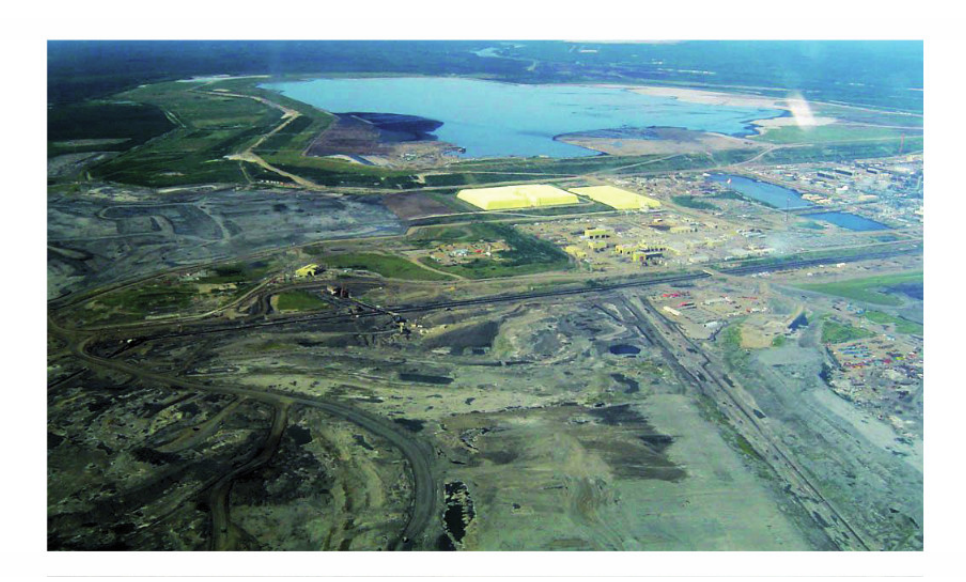
Figure 2: Soil degradation to obtain unconventional oil: tar sands mine site in Alberta, Canada.

After having enjoyed the abundant and low-priced energy of fossil fuels for more than a century, we now understand we must stop using them. After being so excited about the western type economic growth, we are realizing that our development model, consumerism, is unsustainable on a spaceship that cannot land anywhere. Consumerism is also socially unsustainable: it promotes competition, induces not to care about others, causes the loss of the idea of the common good, widens the gap of inequality more and more. We know that inequality means unease and may lead to revolutions and wars. These concerns are taken up by Pope Francis' admonition: "There are not two separate crises, one environmental and another social, but a single and complex socio-environmental crisis; ... what is happening puts us in front of the urgency to proceed in a courageous cultural revolution" (Francis (Pope), 2015).